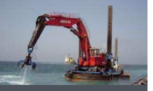
ABEKO SERVER 1 WITH TEREX O&K RH 90 PROFILES ROCK ARMOUR, NEW BREAKWATER IN RAS LAFFAN (QATAR)