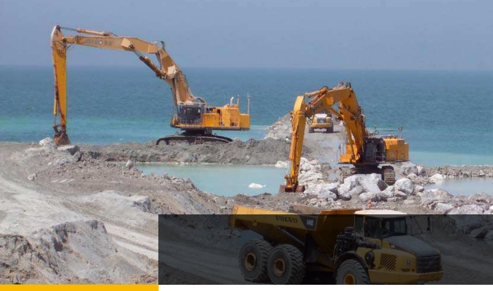
DEMOLITION OF OLD AND RE-BUILDING OF NEW BREAKWATER IN DUBAI (UAE)