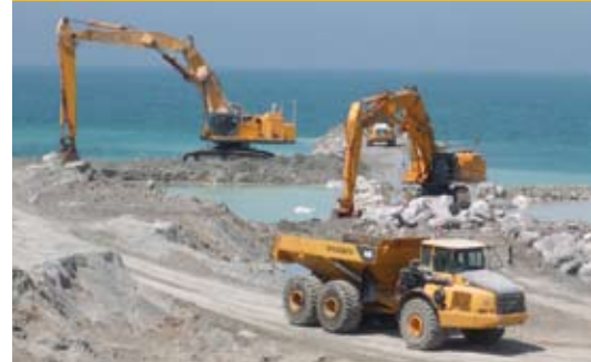
WORKING WITH 2 MACHINES ON A HARBOUR PROJECT, RAS AL KHAIMAH (UAE)