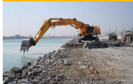
DIGGING A CANAL IN DUBAI (UAE)