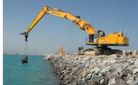
PLACING 12 TON ACROPODES IN A BREAKWATER, RAS LAFFAN (QATAR)