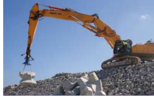
PLACING 8 TON ACROPODES IN A BREAKWATER, RAS LAFFAN (QATAR)