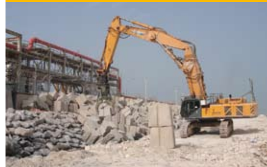
PLACING 6 TON ANTIFERS ON A BREAKWATER WITH A HYDR. GRAPPLE, RAS LAFFAN (QATAR)